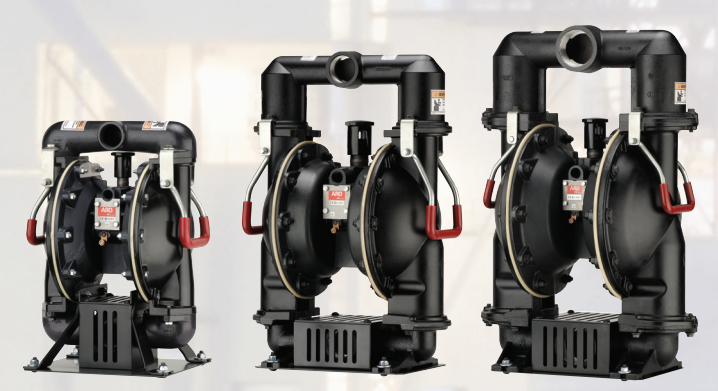
Available in 1-1/2", 2" and 3" port sizes.

ARO® air-operated pumps have been utilized in the mining industry for decades. Their rugged reliability, stall-free operation and convenient portability have made them a fluid handling favorite in every phase of mining operations. These include mud and muck pumping, dewatering, drift dewatering, fuel-transfer, lubrication and more. As part of worldwide Ingersoll Rand, ARO® has the expertise, the technologies, the resources and the performance that is legendary. If your mining operation has a pumping challenge that your current pumps are struggling with...maybe its time you tried a legend: ARO®.